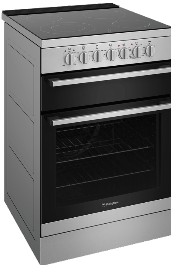
54cm Front Control Freestanding Cooker, Separate Grill WFE642WCB, WFE642SCB